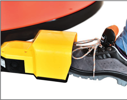
PIZZATO -INDUSTRIAL FOOTSWITCH FOR CYCLE'S MANAGEMENT.