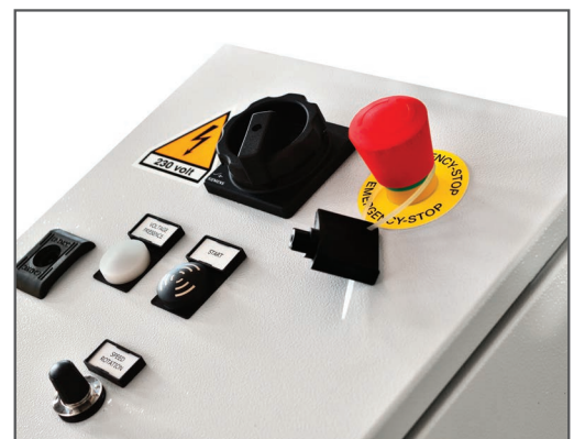
EXTERNAL POTENTIOMETER FOR TURNTABLE'S SPEED ADJUSTMENT