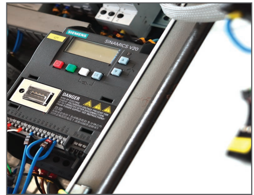
SIEMENS V20 INVERTER