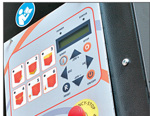
ALL SHORTCUTS (AS) ELECTRONIC BOARD