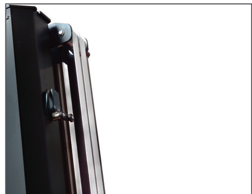
TWIN-BELT SAFETY SYSTEM